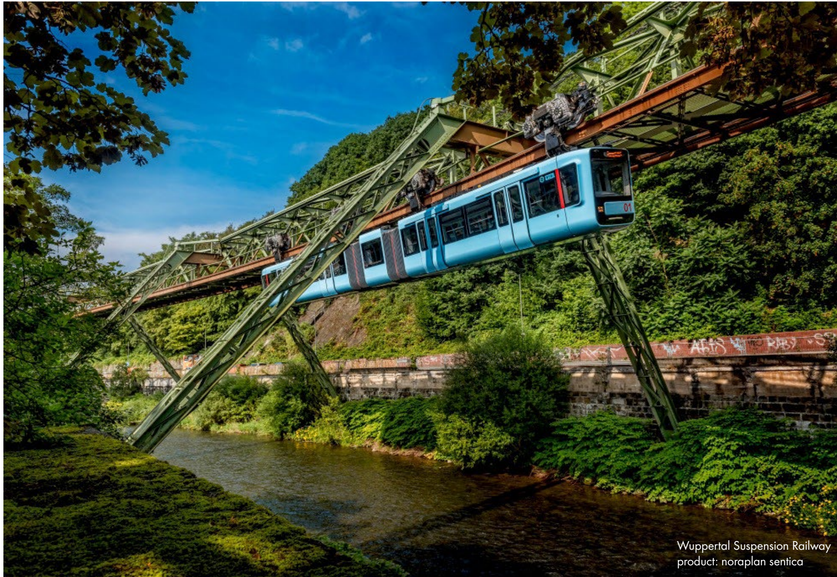
Wuppertal Suspension Railway product: noraplan sentica