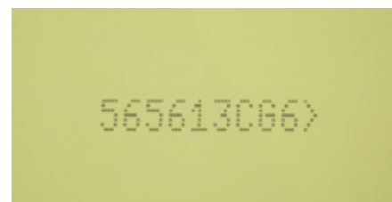
Observe the direction of the arrow on the back of the floor covering and always lay the sheets and tiles in the same direction