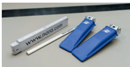
Required cutting tools

Please also see our “General remarks for the installation of nora ® floor coverings, stairtreads and accessories” as well as the installation recommendations norament ® and noraplan ® .