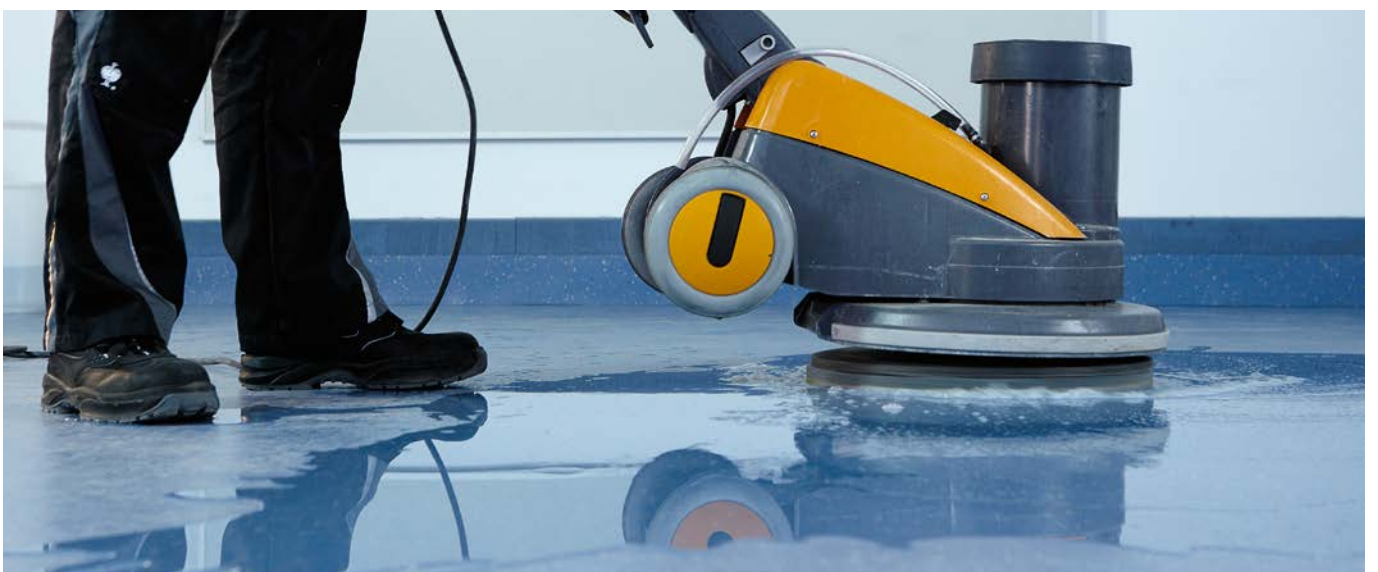
Refurbishment. Removing the most stubborn dirt and scratches