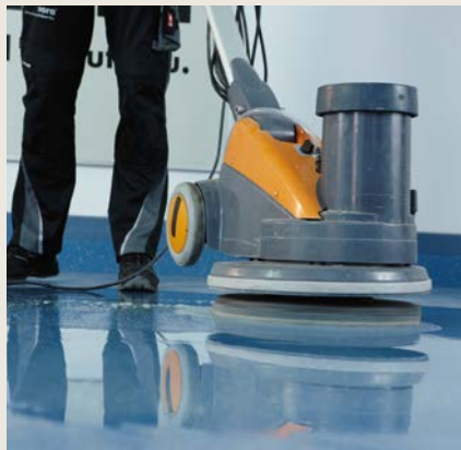
Clean the flooring with nora pads