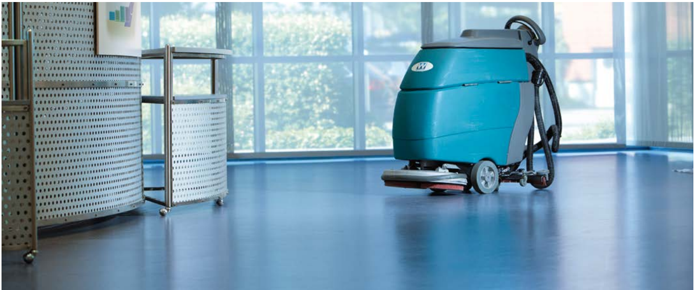
Cleaning. From daily care to intensive cleaning