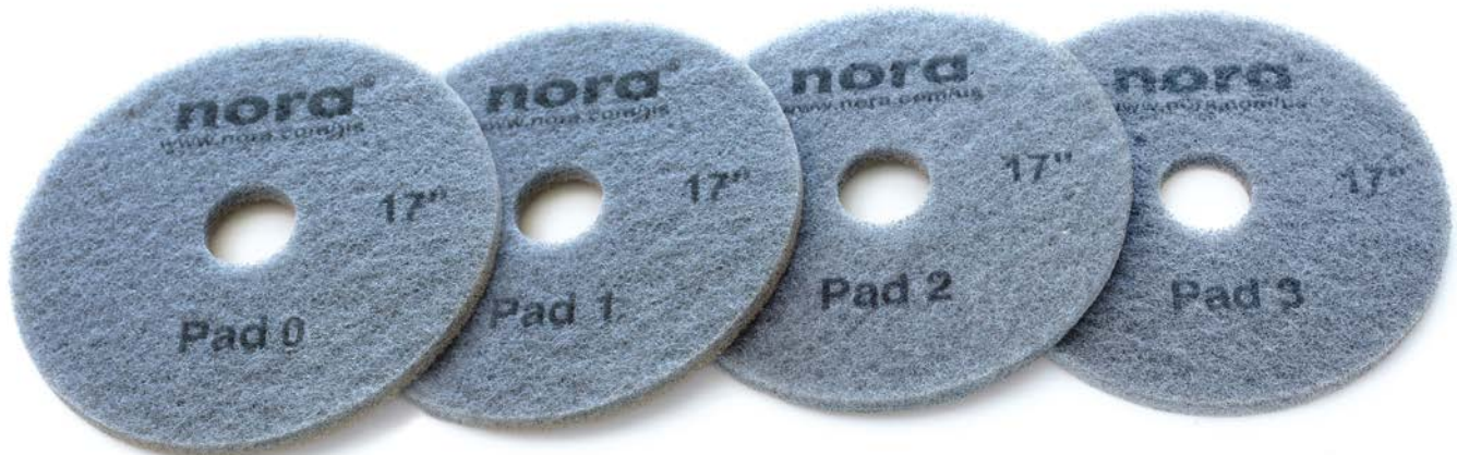
Fully equipped for any job: nora pads in 4 strengths and 6 different sizes