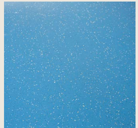
A clean result