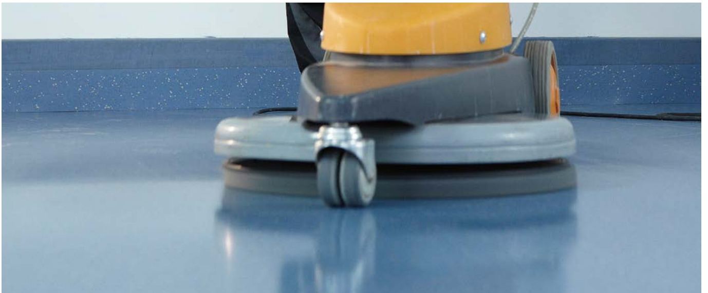
Finishing. Clean coverings first and then polish to a high gloss