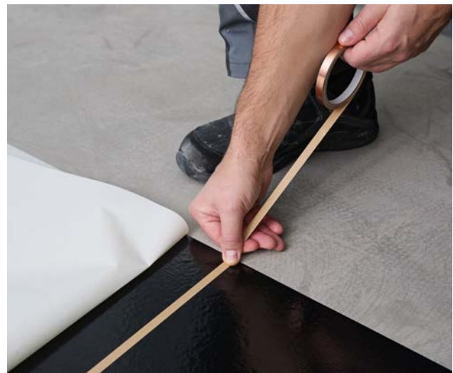
Bond the copper strip