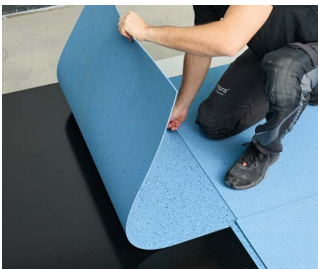
Install the floor covering