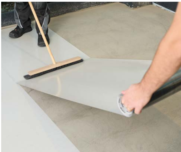
Lay nora dryfix ed on the subfloor