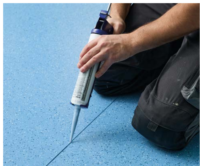
Seal the floor covering