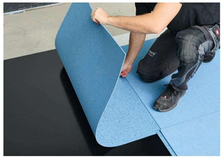
3) Install the floor covering