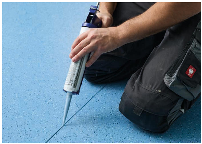
4) Weld the floor covering (where needed)