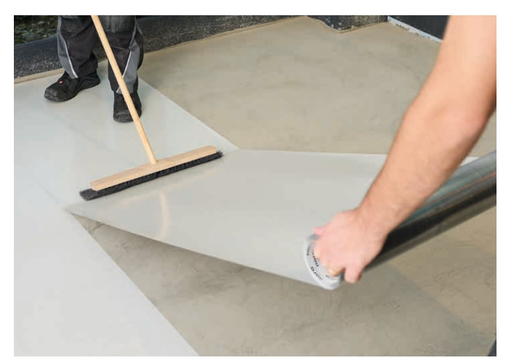
1) Lay nora dryfix ed on the subfloor