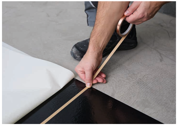
2) Bond the copper strip