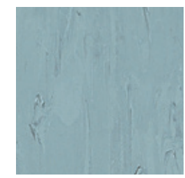
7171 BLUE SPRUCE