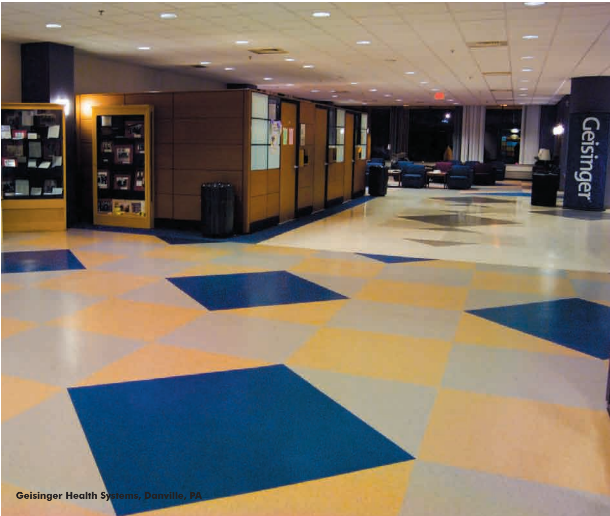
Geisinger Health Systems, Danville, PA