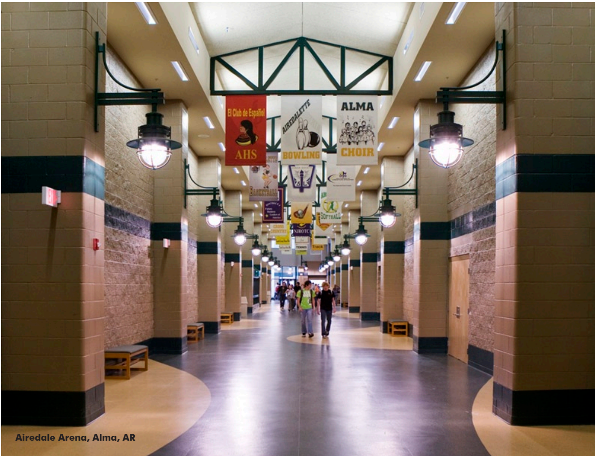
Airedale Arena, Alma, AR